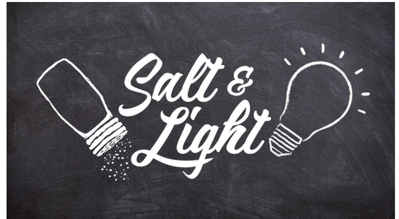
No BUTS about it

We have been RESCUED from our ENEMIES so we can SERVE God without FEAR , in HOLINESS and RIGHTEOUSNESS for as long as we LIVE .