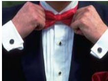
Planning makes a perfect day possible

The official Sunrise Church Wedding Hostess shall be present at any wedding to provide needed assistance. In instances where the wedding party wishes to provide their own facilitator, with the pastor's approval, the official Sunrise Hostess shall be present and paid according to the fee structure.